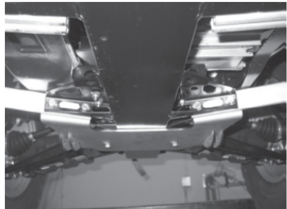
Figure 2 - Install Plow Mount