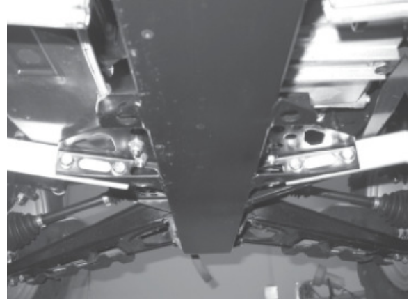
Figure 1 - Remove Bolts