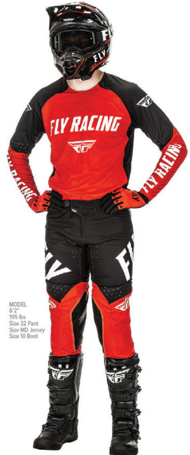
MODEL 6'2" 195 lbs Size 32 Pant Size MD Jersey Size 10 Boot