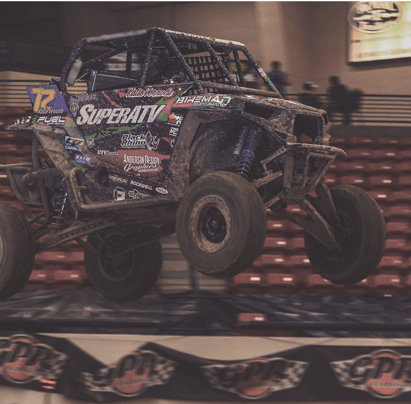
D558 Anza 15x7.0 / 30x10-15R Trail Gripper