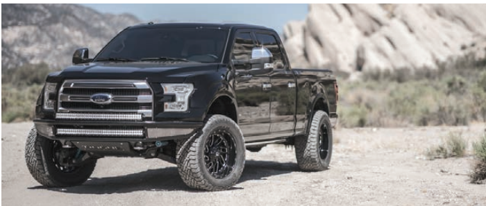
Pictured: 325/605R20 Shown with 20x10 Triton - D581 black and milled