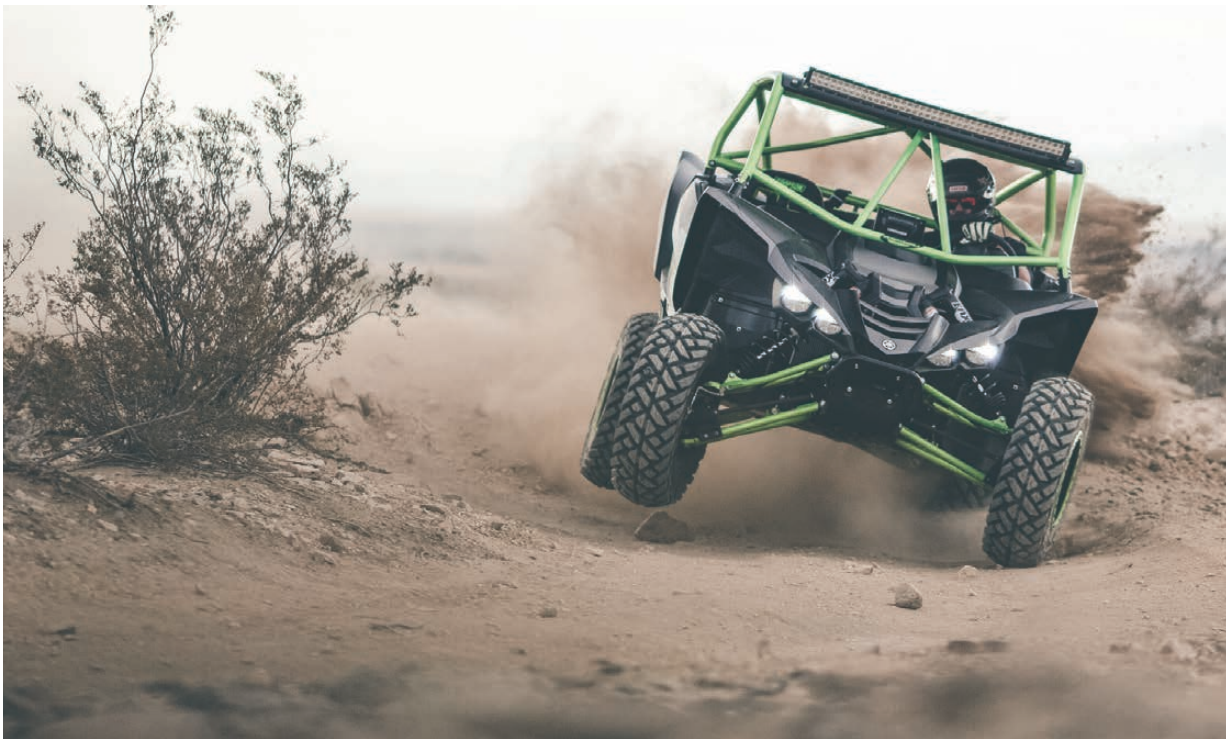
On the move the Fuel Trail Gripper UTV provides all the traction you need to rip through the desert or crawl through a greasy rock garden.