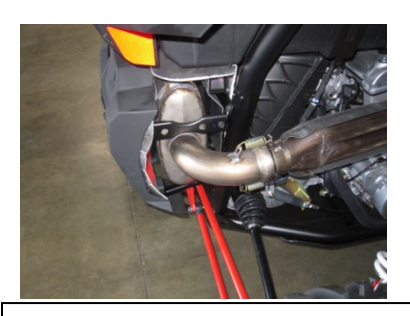
2. Once you have removed the heat shield loosen the factory brackets. Keep loose until final install.

1. Disconnect the negative battery cable before removal of the OEM Exhaust. This will allow the computer to reset and recognize the new exhaust. Lay out the exhaust on the floor so it looks like the drawing and compare parts with manual. Remove the factory exhaust by un bolting the factory rear heat shield bumper behind the factory muffler. You will re use the hardware for the Gibson install. Dis-connect the 4 factory springs and remove the factory exhaust. Do not damage the factory exhaust gasket. You will re use this gasket.