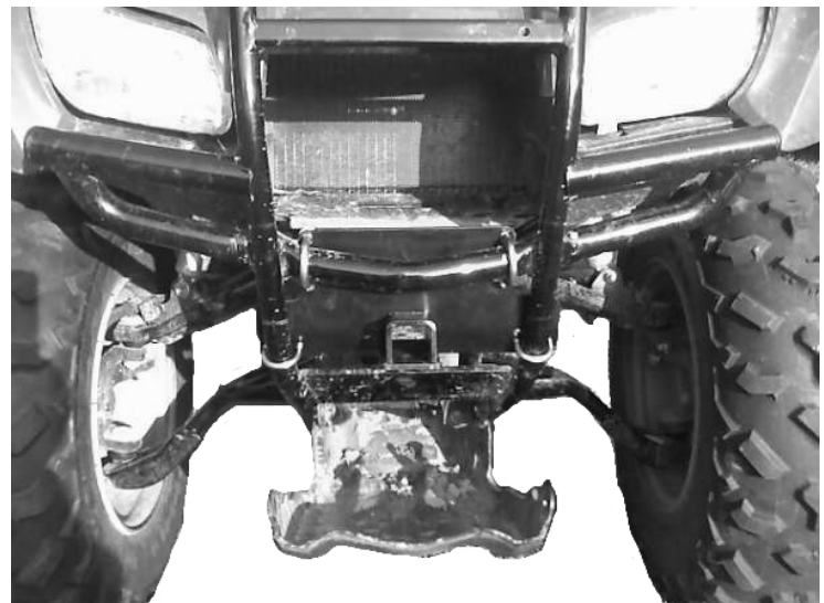
"Figure 2" Receiver Location

NOTE: If you are going to use this for a Multi-Mount Winch application, here is the suggested Contactor Location Using the supplied hardware