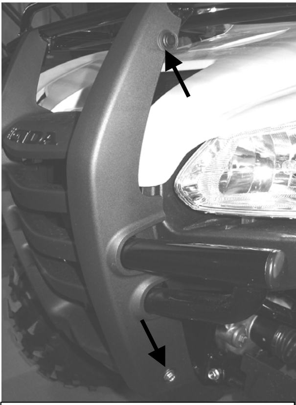
"Figure 1" Remove front Plastic Bumper Cover