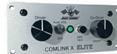
DSP & DRIVER ISO

Hold BLUE Button for 3 seconds to turn Bluetooth ON/OFF Hold for 10 seconds to sync with Bluetooth Device SOLID BLUE LED - No Device Connected SLOW Blinking BLUE LED - Device is Connected