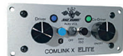
BLUETOOTH, DSP & DRIVER ISO

Hold Black Button for 3 seconds to turn DSP ON/OFF Press Black Button once to turn Driver Isolation ON/OFF GREEN Blinking LED = DSP is On ORANGE Blinking LED = Driver Isolation is On ORANGE / GREEN Blinking LED = Both are On