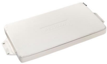
70Q-SEAT-WHT Seat Cushion - White