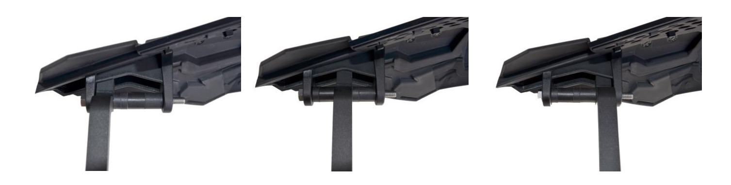
STEP 7: At this time go back and check the torque of all fasteners. All fasteners may need to be retightened after the first ride. Check the tightness of the bracket and handguard before each ride.

need to be used). There are 9 possible positions available. Repeat step 6 for both sides.