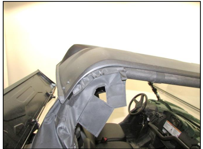
7. Match the velcro strip near the loop and velcro on the flap and attach.