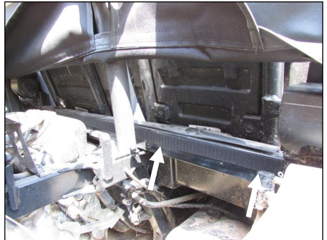
9. Attach a strip of self adhesive Velcro on the back side of the cab on the lower crossbar. Attach back panel lower flaps.