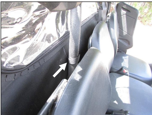
10. Secure the back panel with two Velcro loops around the rear pillars of the cab. There is one behind the passenger and drivers seats.