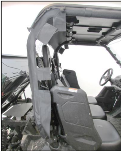
8. Secure the remaining flaps on the sides of the vehicle. If needed, refasten the velcro straps to adjust the fitment of the textiles.