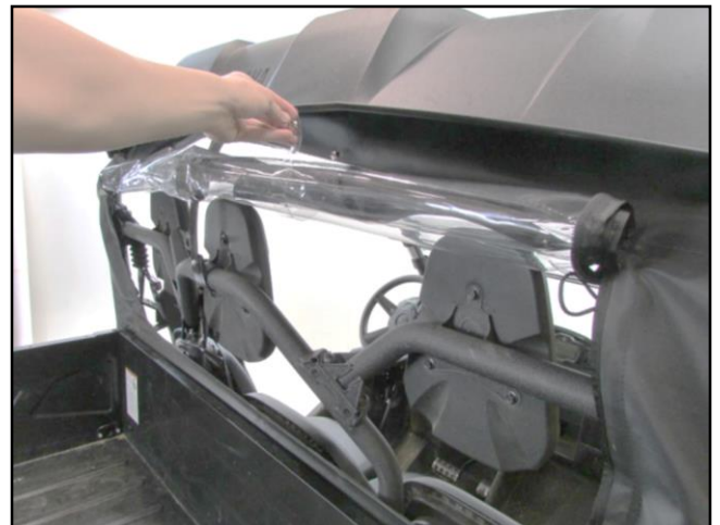
11. To roll up the back window, unzip the vinyl section and roll up. Use the vinyl straps to secure the rolled section.