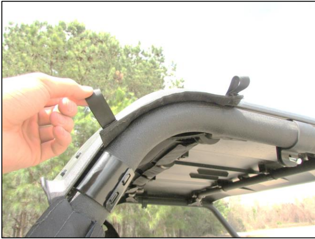
6. Pull the loop through the side of the vehicle between the roll cage and roof.