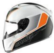
Race -R PRO