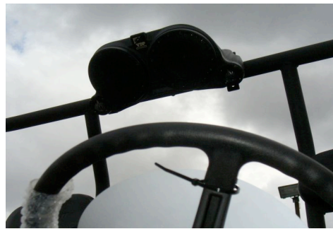
Front View Installed