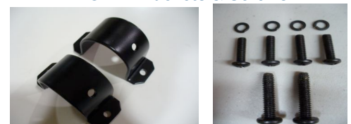
Part #71XXB (Fits 1.75" Bar)