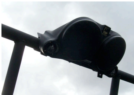
Close Up Installed on a Ranger