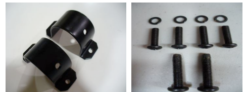
Part #70XXB (For 1.5" Bar)